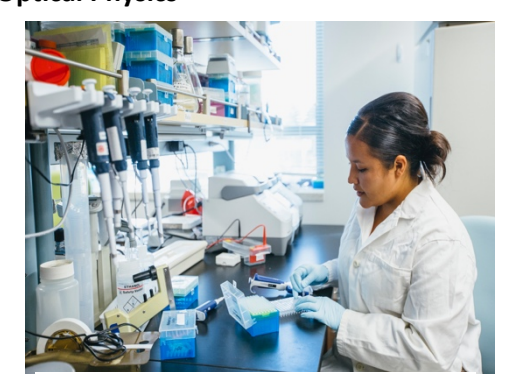
Molecular analysis of mammalian gut microbiome