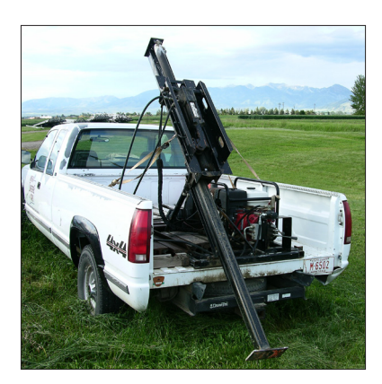
Figure 2. Soil sampling vehiclemounted hydraulic probe.