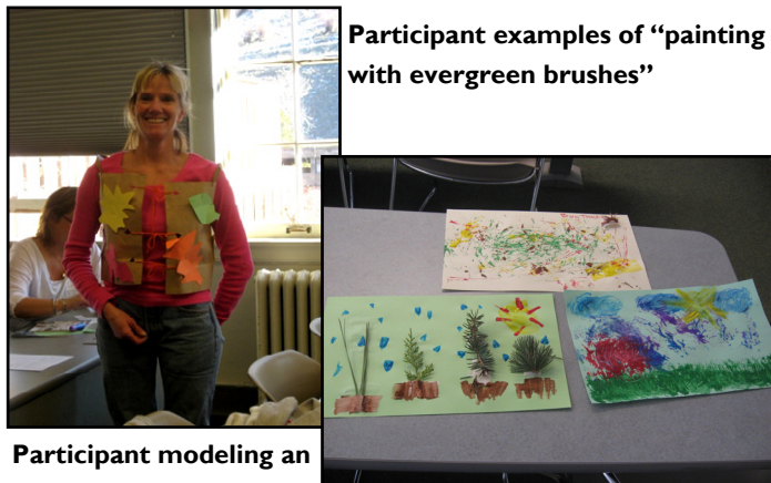
Participant modeling an example of a table activity “tree costumes”.

Next we went outside and visited some local trees and learned about how they grow, what they need to grow (Activity 9, “To Be a Tree”), and differences between trees by looking at their shapes, bark and leaves (needles) and by feeling the bark and needles (Activity 3, “Get in Touch with Trees”). We discovered what animals use the trees (Activity 10, “Trees as Habitats”). We looked at shapes, smelled tree needles (juniper is pungent!), and listened to the sounds around us as we took our walk. (Activity 1, “The Shape of Things” & Activity 2, “Sounds Around”)