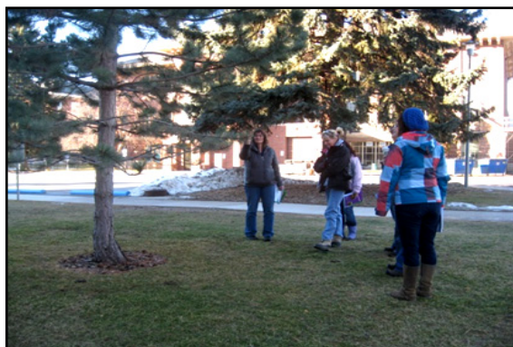
Identifying a pine tree outside of the Forestry Building on the UM Campus.

Participants were introduced to the Early Childhood guide (Teachers Choice Award 2011) and various PLT materials and grant programs. The workshop began with an ice breaker activity where each participant had a tag on their back with the name of a particular product that was made or came from parts of a tree. (Activity 4 “We All Need Trees”) They had to ask others questions to try to determine what product they were which included berries, furniture, egg cartons, and food items that contained additives derived from trees i.e. gumdrops.