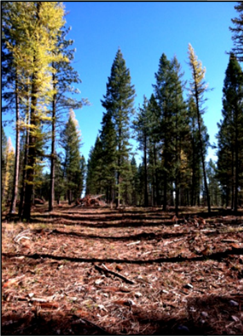
2012 “Walk in the Woods” location

“ This is a great event to hold during Fest Products Appreciation Week“