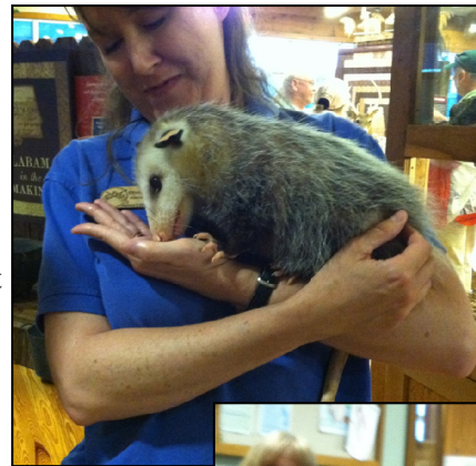
Five Rivers Learning Center