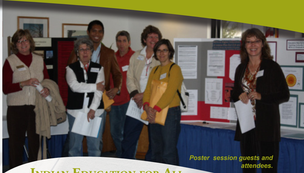
Poster session guests and attendees.